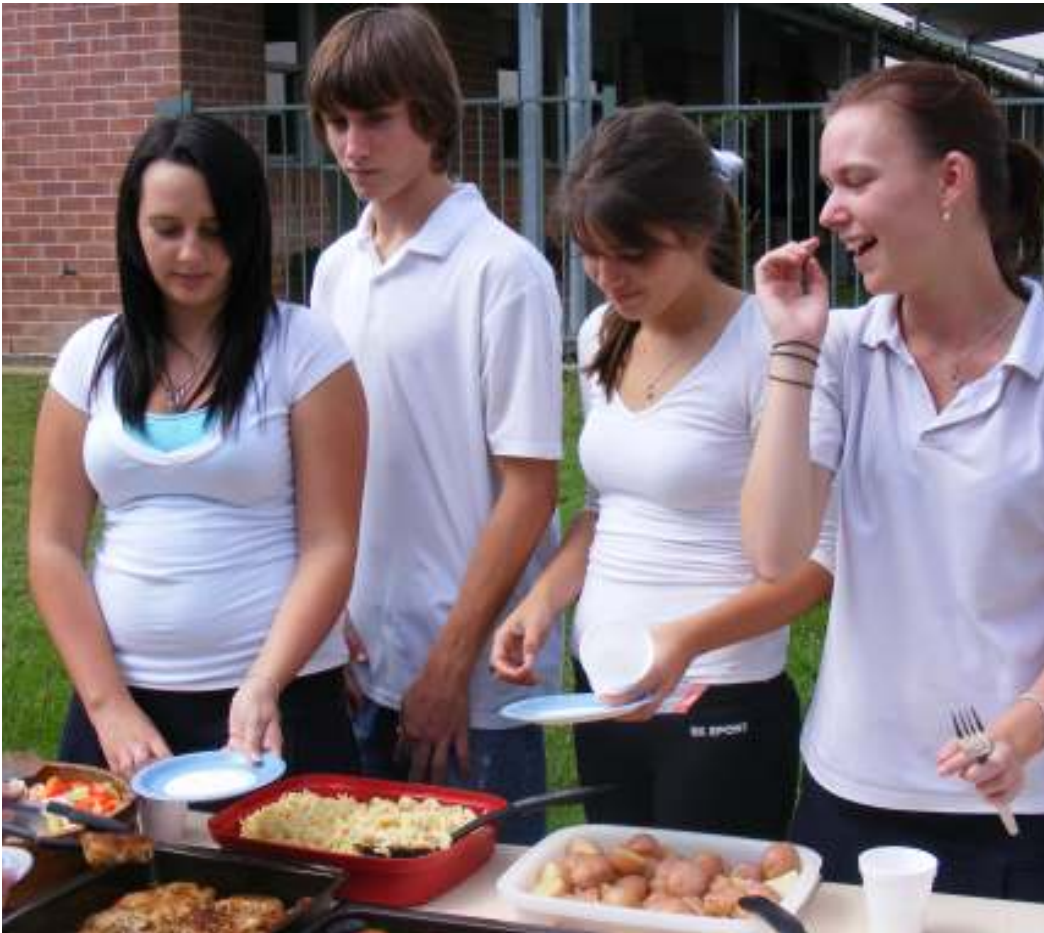
Enjoying a healthy lunch