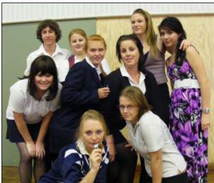
The Cast of the Production