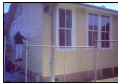
P1 & P2—1st to get a coat of paint

A major maintenance program got into full swing at Grafton High this week. The transformation of DL1, DL2, and DL3 is well under way. Maintenance and paintwork around the rest of the school has also started. All of this work will add to the fresh look of Grafton High School. By the end of Term 2 most work should be complete. This will help create a very pleasant environment in which to learn.