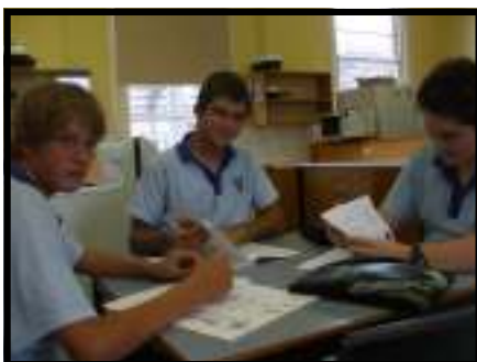
Students from Food Technology taking down notes.