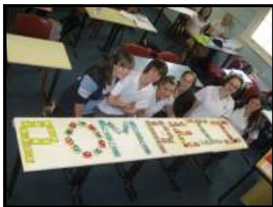
Year 12 Ancient History students learning about the buried city of Pompeii. (Yes, those letters are made from decorated biscuits)

All uniforms $4.00 off As there is to be a large price rise with the next uniform order this is a good opportunity to grab a bargain.